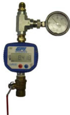
Simple Flow Meter

ZERO WASTE – Knowing where the lubricant is being used or wasted is paramount in optimizing usage and application. With hard data to support before and after reductions, the end user can eliminate the waste and focus on using only what is necessary in the process.