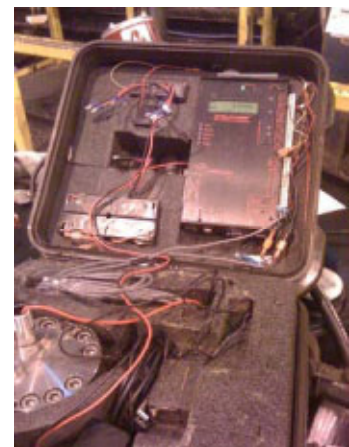
Inside the Green Box Data Logger & Flow Meter