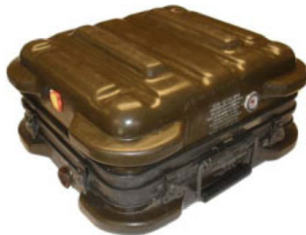
The Green Box